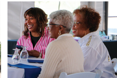
Attendees enjoying the entertainment at Generosity Summit 2025 in September.