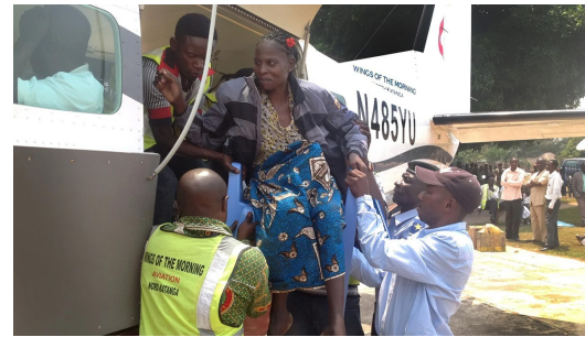
Wings of the Morning