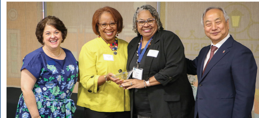
Gaines UMC receiving the new Kingdom Builders Award at Celebration Luncheon in May 2025.