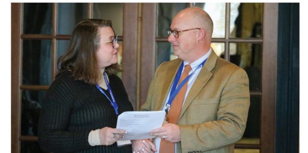
Ten clergy couples enjoyed our 2025 Clergy Couples Retreat at Mohican State Park Lodge in February.