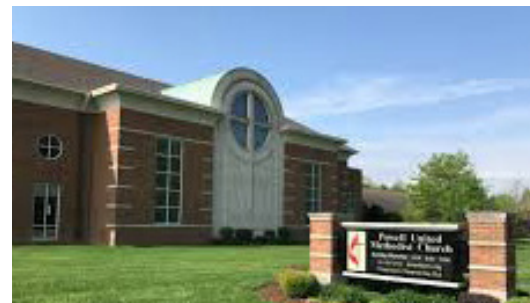
Stock gift beneficiary Powell UMC

The Foundation facilitated $621k in gifts from donors to the local church, including 28 gifts of stock totaling nearly $548k .