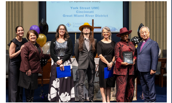
Presenting the award to York Street UMC for the Breakout Vision at the 2025 Go Grants

The Foundation made 47 grants totaling $133k .