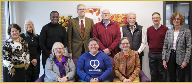
UMFWO Board of Trustees November 2025