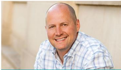
Donor Advised Fund