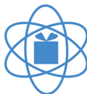
Charitable Gift Annuity