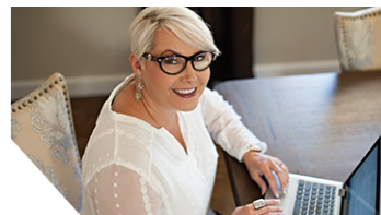
IRA Charitable Rollover