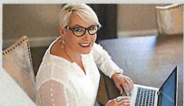
IRA Charitable Rollover