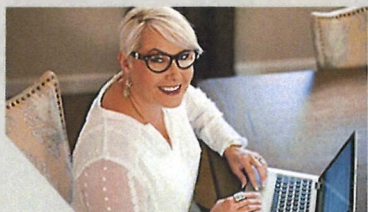
IRA Charitable Rollover